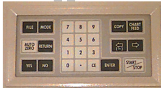
Figure 2: Spectrophotometer Control Panel

Note: Light source runs from the right to the left through the sample in the cuvette chamber.